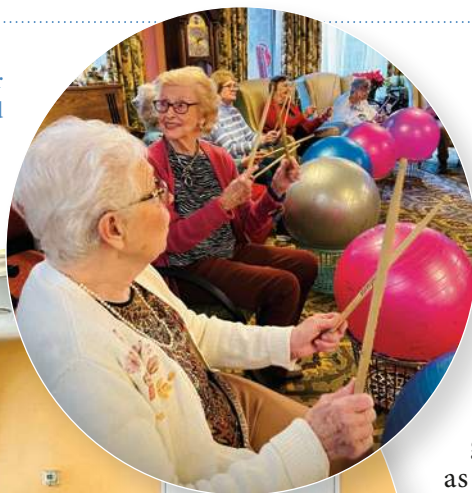
Our lively St. Mary's Woods drumline taps out a beat.